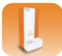
Optima Gas Chromatograph